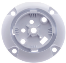
Flush Mount Plate B30202