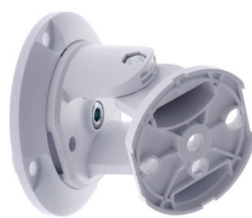
Adjustment Bracket B30201